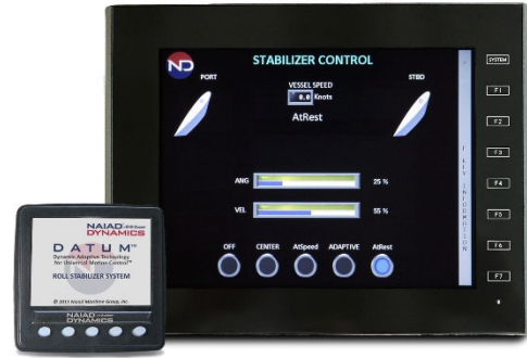
DATUM™ graphical display panel options, each with intuitive multi-page display screens.

Naiad Dynamics stands behind every system sold with its superb Limited Warranty. NAIAD® products are supported worldwide by our seven sales and service centers and mobile fleet, and by our comprehensive Authorized Dealer Network with locations in key regions for fastest response and guaranteed satisfaction. Spare parts are usually in-stock and ship within 24 hours, and our state-of-the-art in-house manufacturing facility ensures quick turnaround on parts throughout the life of the system.